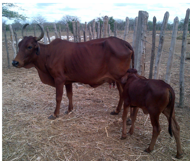
Figure 1 – Red Sindhi cow and calf in a Brazilian semi-arid region.

Today, most herds are located in the Northeast and Southeast regions of Brazil. This breed is generally considered suitable to be used in dual purpose production systems, dairy and beef. However, selection in the Southeast herds was more emphasized on beef traits, in contrast to the Northeast herds that selected mostly for dairy traits. In the Northeast of Brazil there is a predominance of harsh environmental conditions, with high average temperatures and very low precipitation. The Red Sindhi has been well adapted to those conditions, and most breeders claim that cows can keep good body condition scores and good fertility even in these very harsh environments.