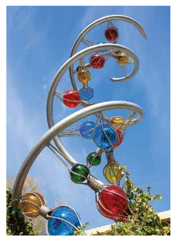
"Genomics Garden," U.S. Department of Energy Joint Genome Institute.

The global population continues to expand and is poised to reach 9 to 10 billion by the year 2050. Feeding GM crops to livestock will continue to play an integral role in food security and our country's ability to meet a growing global demand for animal-source protein.