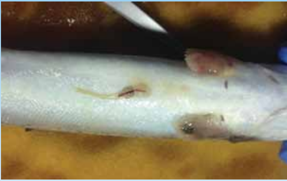
Adult female Lepeophtheirus salmonis , located ventrally between pectoral and pelvic fins, on Atlantic salmon post-smolt.